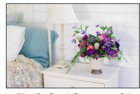
The company repurposes floral arrangements to donate to hospitals and retirement communities

A Role Model in Floral Creativity and Reuse